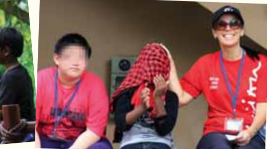
Deutsche Bank staff together with 100 Friends of Children's (FOC) kids got up close and personal with some feathered friends! It was an awesome time of fun and learning to kick start the June holidays!