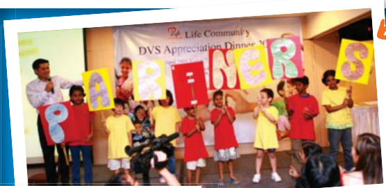
Our children give meaning to the word 'PARTNERS' as they thank LCSS stakeholders for their unwavering support during the current tough times.