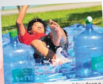
Great FUN! Human Bowling – sliding down a slippery mat to score a strike!

IFGF organised a FUN-tastic day at the East Coast Park for the youths of FOY. They raced across the park, stopping at different stations to face challenges that equipped the youth with some necessary life skills. The youths put their energy in a positive manner in completing the race. Through perseverance and determination, all the teams made it to the finishing line, where they received prizes for finishing the race!