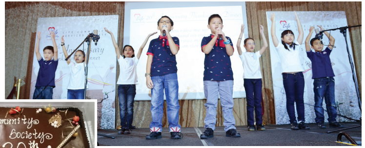
The opening performance by the students of Life Student Care, singing 'You Raise Me Up'

Life Community has been given the humble opportunity to serve the vulnerable children & their families for the last 20 years. This would not have been possible without the support of all our donors, volunteers and staff.