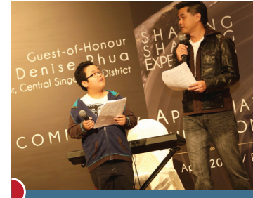
Our beneficiary from MightyKFC program appointed as a co-host at the luncheon. He was a hot favourite!

This potter's wheel is specially designed by a team of two children at Life Community during a 3D printing workshop sponsored by Seagate Technology International. [The design is printed from a 3D printer with a specialised thermoplastic, PLA (Polylactic acid) , as the print material. The printing for the gift took about 7 hours.]