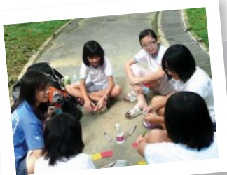
Social - Connect time

S.P.I.C.E.S emphasises on the total development of our children.