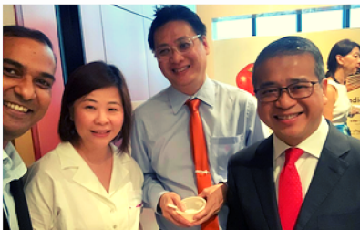
Social Service leaders with Mr Edwin Tong

LCSS received the MCCY Charity Transparency Award 2022! This award recognises charities who have adopted good transparency and governance standards, acknowledging their excellent work while inspiring others to emulate their best practices.