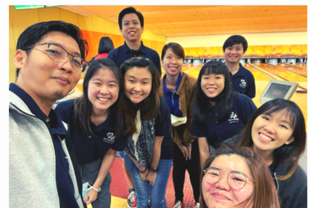
Our Friends of Children & Youth (FOCY) team

Thank you, Singapore Prison Service and Yellow Ribbon Singapore, for recognising our efforts in shaping a more compassionate and inclusive society!